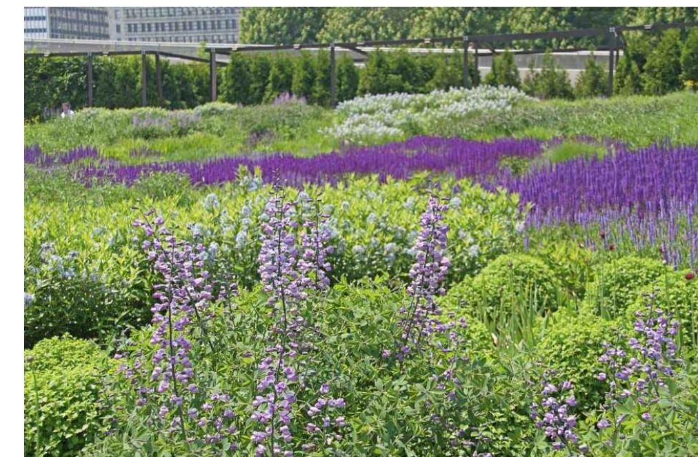
Sweep of colourful Lavender and Salvia spp