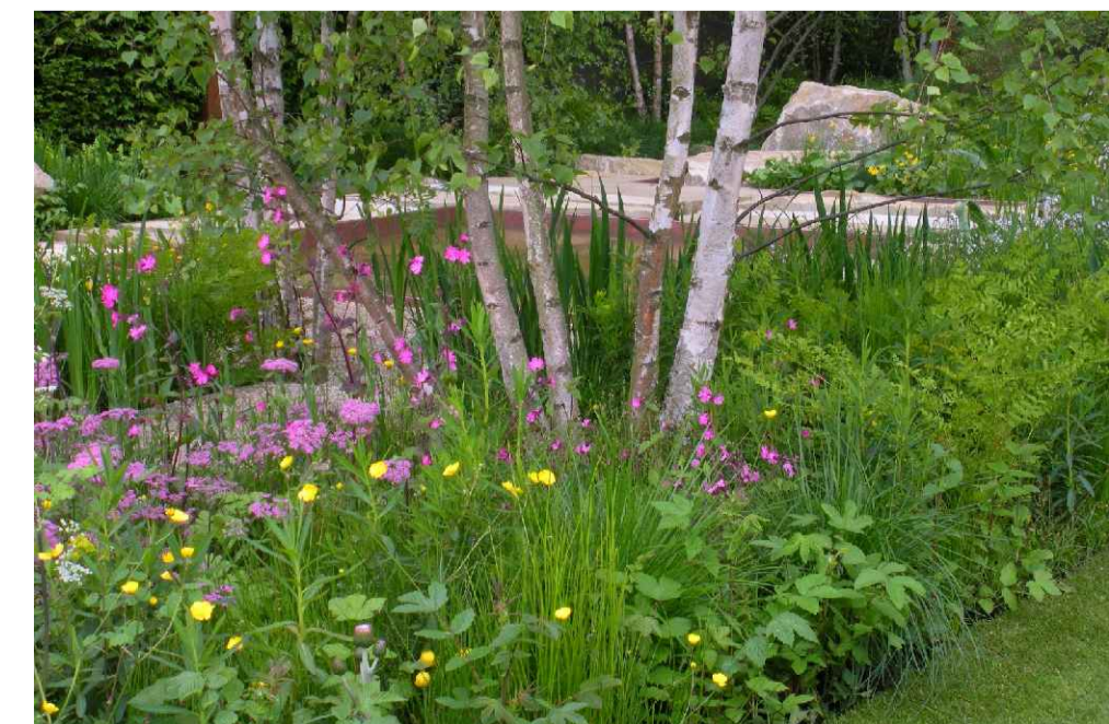
Herbaceous perennials to landscape areas.