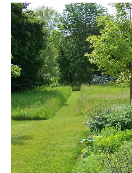
Mown grass between ground cover beds.